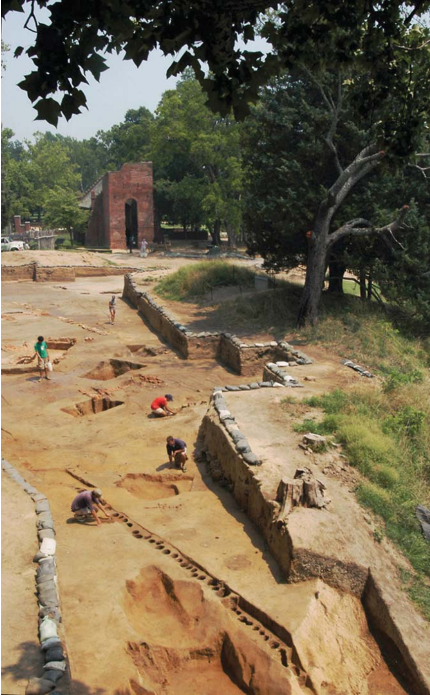
View of the western palisade with posts excavated and a saw pit adjacent to it (foreground), a cellar, two double burials, a chimney foundation and cobble wall footing of a 1611 'row' house (middle). The 17th-century brick church tower in the background post-dates the fort (APVA).